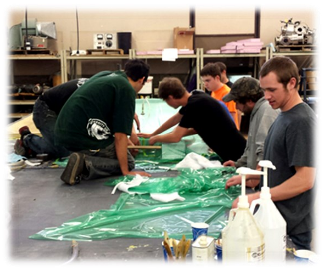
Undertray debulking in progress

To make light of the down time the team was still able to continue refining the laser timing system featured in last month's newsletter. Most important of all though, OTR4 started and ran on the new turbo system, and the decision has been made to continue with the turbo system. Stay tuned for more OTR4 updates!